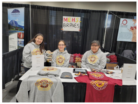
MEHS students represented our school with pride at AFN Oct 20-22