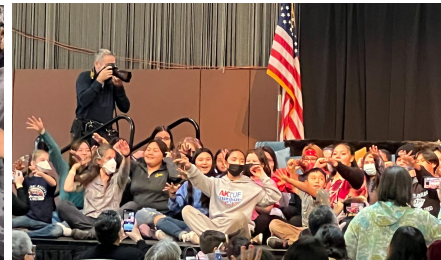
MEHS students join an invitational dance during Elders & Youth Conference