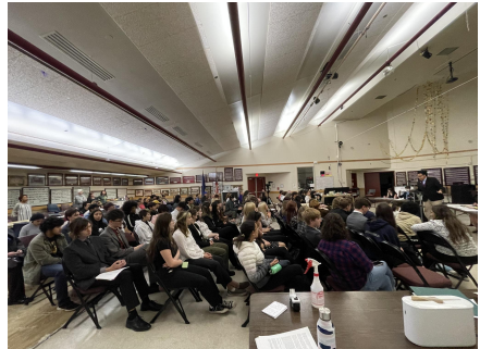
MEHS Hosts first Southeast DDF competition of the season Sept 15-17