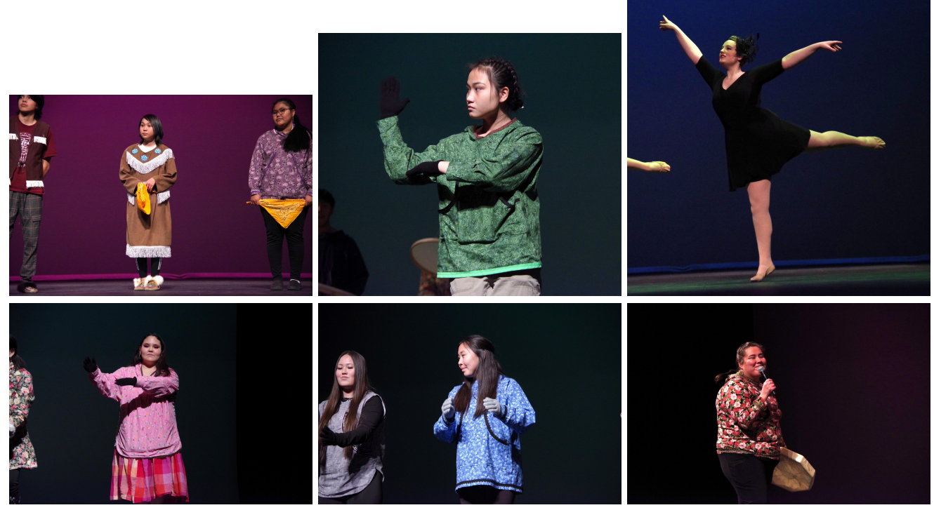
MEHS students are among local dancers, performing on stage during the Sitkans Can Dance event, Oct 5