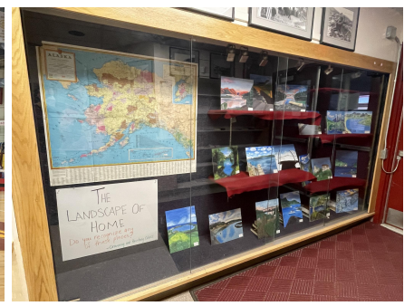
Student art paint landscape of home