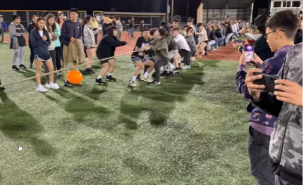
MEHS students enjoy the Field Day including class tug-o-war Oct 16