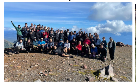
35 MEHS seniors complete the 14 mile hike to the top of Mt. Edgecumbe 9/17