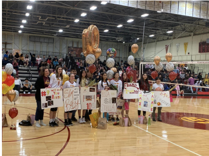
MEHS Girls Volleyball Senior Night