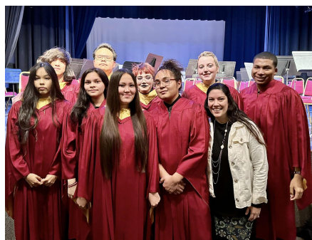
MEHS Honor Choir has the most qualifiers in all Southeast Oct 22-26